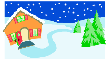
HOORAY!!! NEW FRONTIES